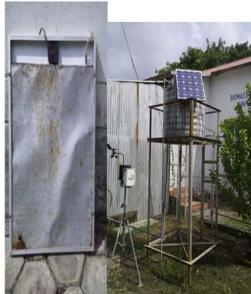
Fig.2.3 SPECIALLY DESIGN SOLAR PANEL

Working:- In PV system because of sunlight huge amount of heat is produce at