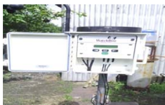
Fig.2.1 WATCHDOG IN RGPV

Weather Monitoring Station, Watch Dog:- Solar Irradiance and ambient temperature is measured by using a Weather Monitoring Station